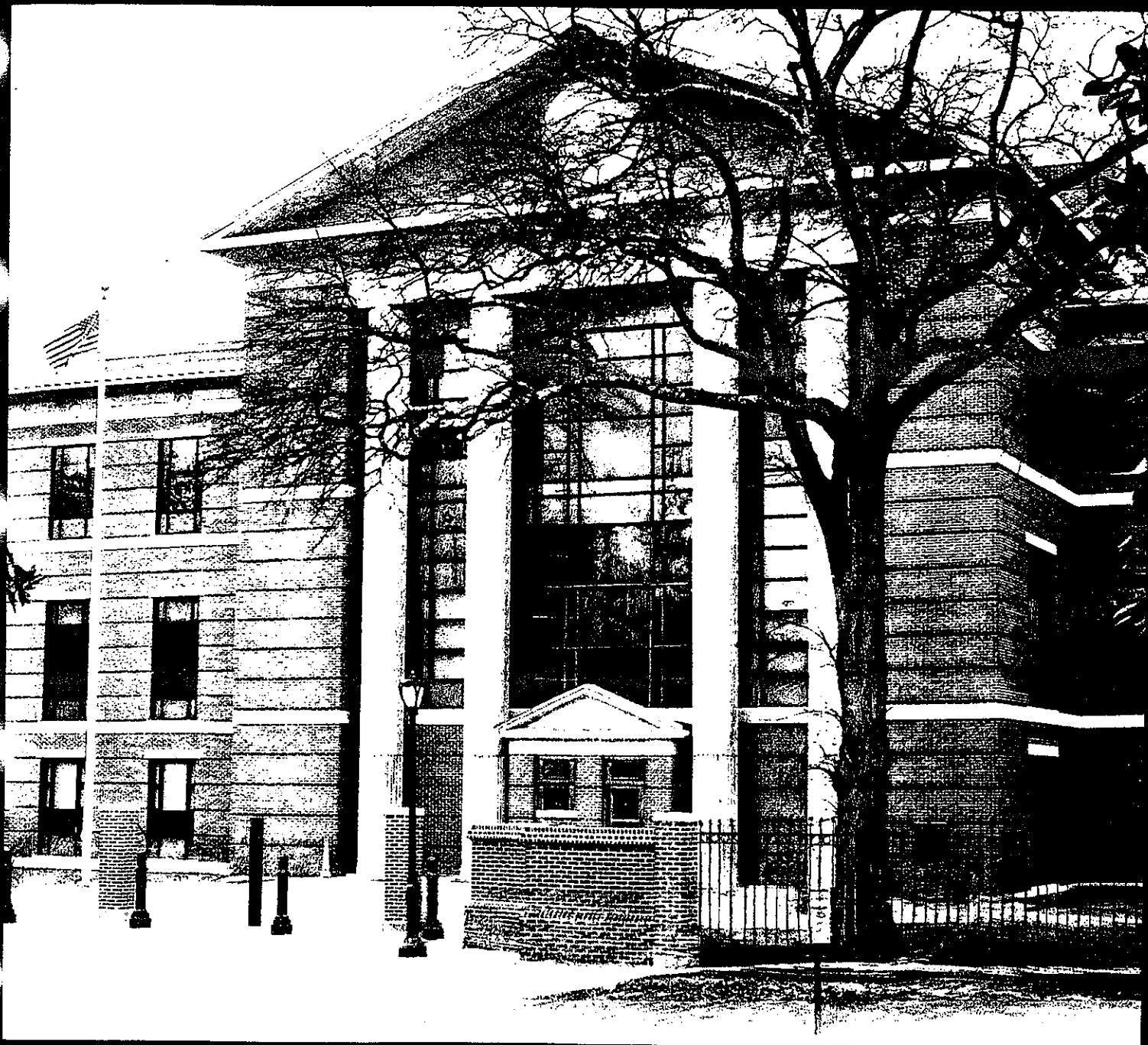
Matthew J. Perry Federal Courthouse Columbia, South Carolina